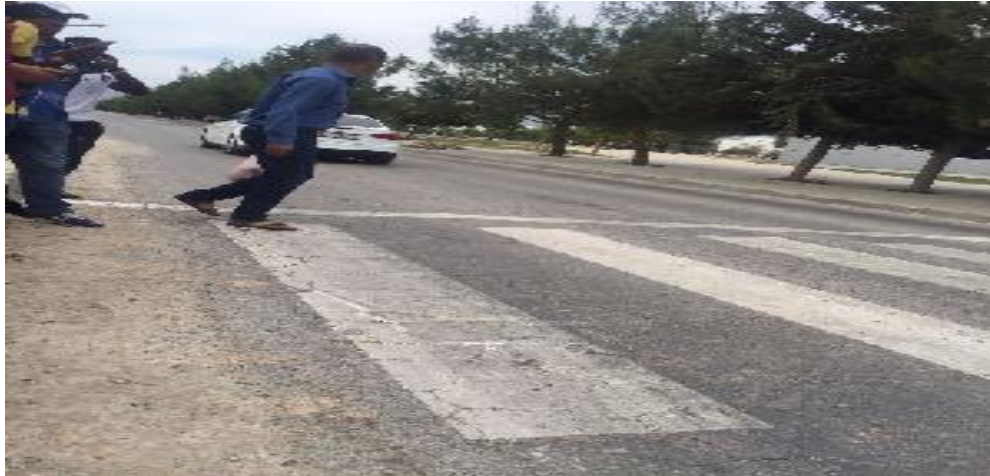
Fig. 5: Edge crack in flexible Pavement

Distress in narrow pavements are edge cracks which start from the edge and extends, it looks similar to fatigue cracks. They happen because of weak material or excess moisture which is not supporting the shoulder of the pavement well as demonstrated in Figure 5. Causes are different according to the pavement situation. For instance, it could be from poor drainage which the water is near to the edge, soil movement beneath the pavement, heavy traffic close to edge, infiltration of water to the base, lack of strength in surface and base [26].