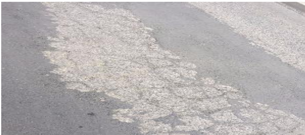
Fig.8: Flexible pavement Patching sample

There are small pieces of asphalt pavement in the surface which is more than 0.1 square meters and they are replaced or their materials increased in a portion in the construction of pavement called patch deterioration as demonstrated in Figure 8. Several issues cause patching for instance when the original distress spreads, poor connection would be between the patch and existing pavement, wrong compaction while patching, wrong material mixing, and rut settlement appealing at the perimeter or inside the interior side of the patch [29].