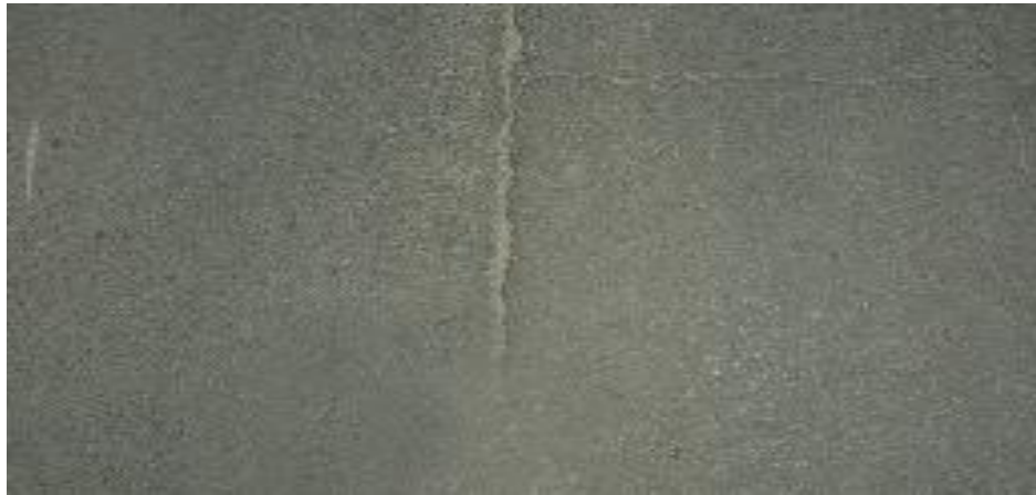
Fig. 2: Longitudinal crack in flexible Pavement

There are some fractions that are mostly appearing in the centerlines of the pavements which is called longitudinal cracks [21]. As shown in Figure 2. Climate affects the shrinkage of the asphalt layer and it helps these cracks to grow. The same time joining two sections of the pavement with a poor construction is another cause and temperature cycling or unfair operations on the paver could be the reasons for these cracks [22].