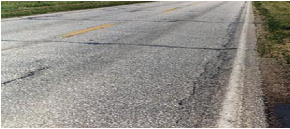
Fig.6: Rutting crack in flexible Pavement