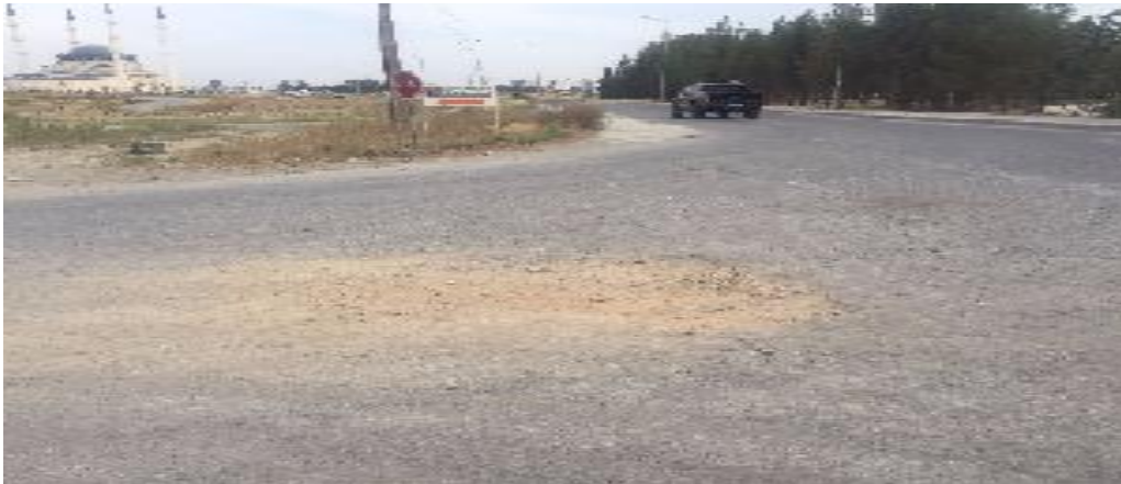
Fig.7: Pothole in flexible Pavement

There are holes like depressions in a bowl-shape, which is a progressive failure and called pothole. A tiny piece of the first layer is destroyed and gradually distress goes down to other layers in the bottom of the pavement as demonstrated in Figure 7. The causes are a lack of pavement thickness to handle traffic in freeze or thaw times. Meanwhile, Poor drainage as others, raveling of cracks which cause pothole. They can be repaired with rebuilding or excavating, the repaired area may require immense potholes [29].