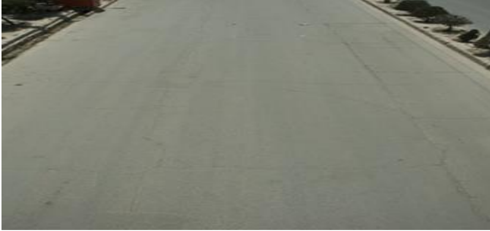
Fig. 4: Block crack in flexible Pavement

Block cracking happens unlike other cracks specifically alligator cracks, they are a collection of interconnected rectangular pieces which could be all throughout the width of the pavement not just in the wheels' paths as demonstrated in Figure 4. If the severity is low in these cracks, it is possible to repair and fix it with a "thin wearing course". But high severity may need overlay and recycling. The causes are proved to be aging, oxidative hardening of the Asphalt Concrete (AC), wrong binder mixture, high void content, shrinkage and temperature cycling [25].