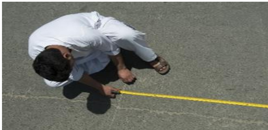
Fig. 3: Transverse crack in flexible Pavement [24].