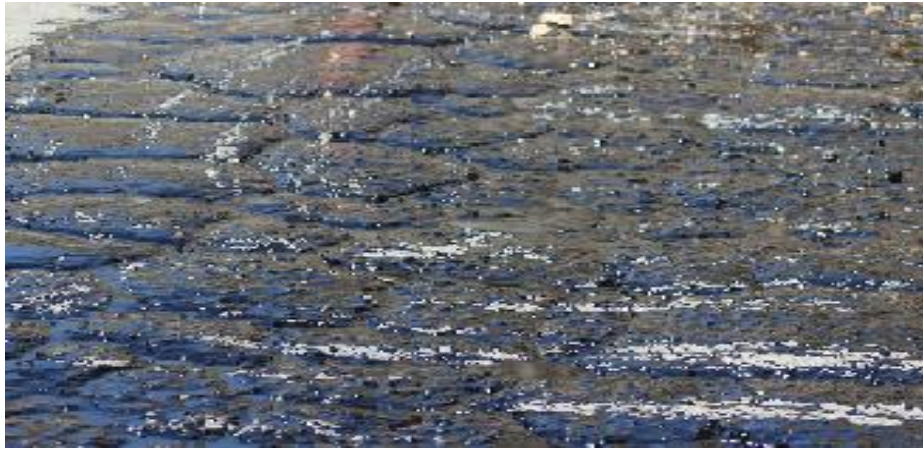
Fig. 1: Crocodile Cracks in flexible Pavement